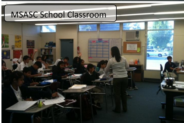
MSASC School Classroom