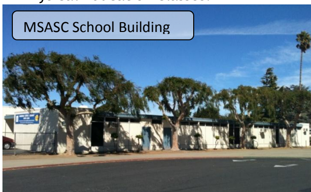
MSASC School Building

MSA-SC currently has no gym, library, or cafeteria. The soccer field is used for Physical Education classes.