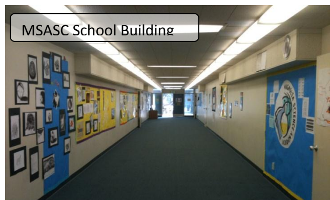
MSASC School Building